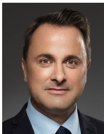
Xavier Bettel Prime Minister, Minister for Communications and Media, Minister for Digitalisation

For all these reasons, and many more, Luxembourg is the right choice, the perfectly connected host for the European Cybersecurity Industrial, Technology and Research Competence Centre.