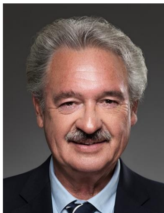
Jean Asselborn Minister for Foreign and European Affairs